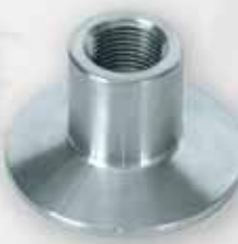
Diaphragm Flanged, threaded / flush or off-line diaphragm