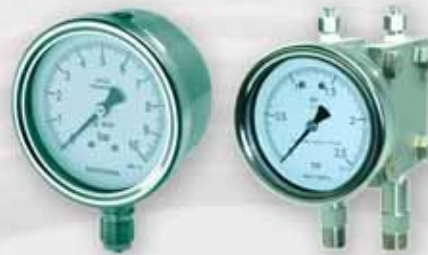
Badotherm Pressure gauge

The below overview show the numerous instrument combinations that are possible. For each application, the instrument combination can be different. The process determines whether an instrument can be mounted directly into the process or requires a manifold, an overpressure protector, a diaphragm seal, or any combination of these accessories. These so-called 'instrument-towers' can be supplied