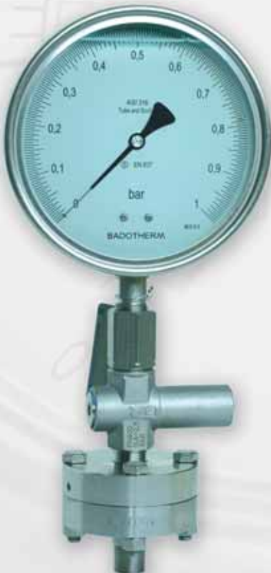
Example of pressure gauge combination with overpressure protector and threaded seal.