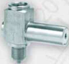
Overpressure protector / snubber