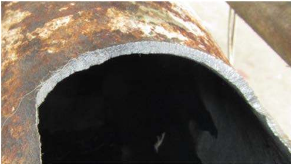
Figure 4. Traverse part of fracture surface