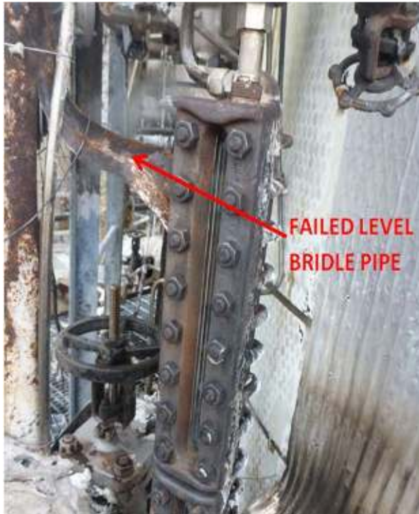
Figure 3. Failed level bridle