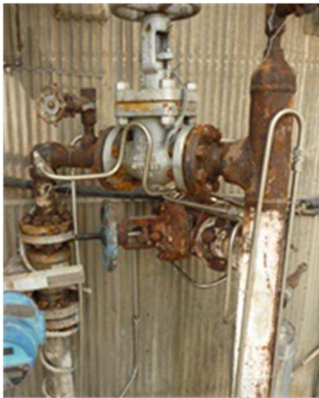
Figure 2. Failed level bridle